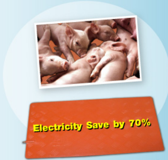
Comparison of electricity consumption between Heat Pad and Infrared Lamp 100 watt